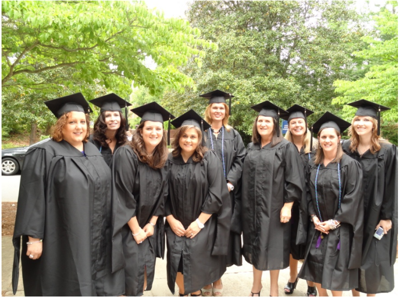
Class of 2012